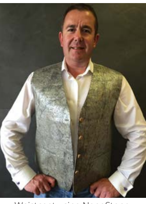
Waistcoat using NanoStone

Let your imagination take inspiration from the flexibility in design and flexibility in use that our unique real stone products offer.